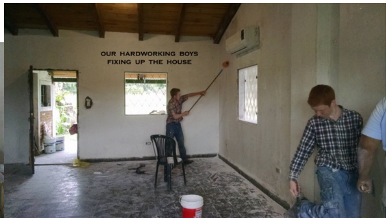
OUR HARDWORKING BOYS FIXING UP THE HOUSE