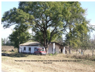
PICTURE OF THE HOUSE AFTER WE PURCHASED IN 2012 WITH THE OLD TILE ROOF

You are welcome to come and help us install these items and rejoice in the Lord for the great things he has done!